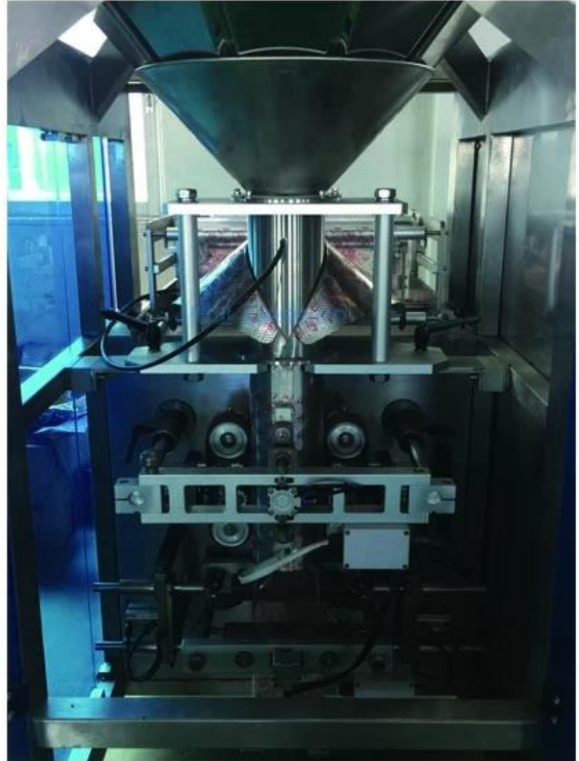
MAIN PACKING MACHINE