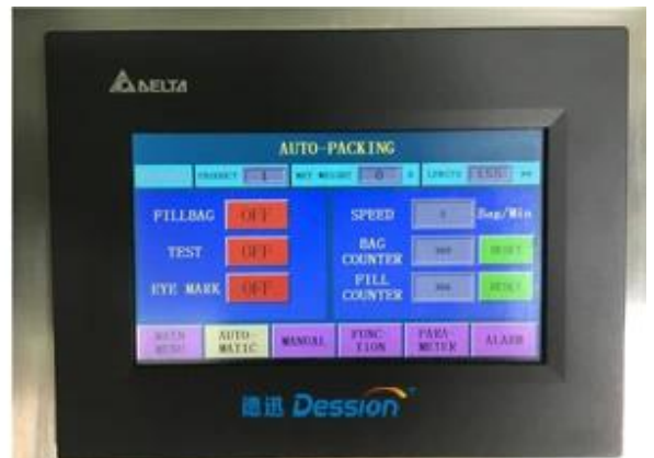
Simple and convenient operation area