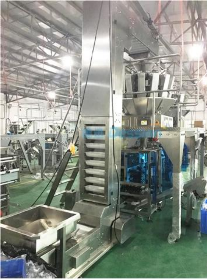
The right Size