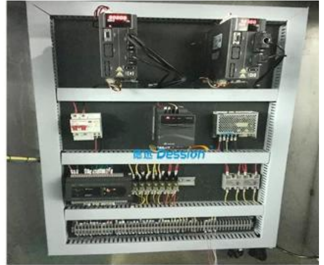
Electronic control components