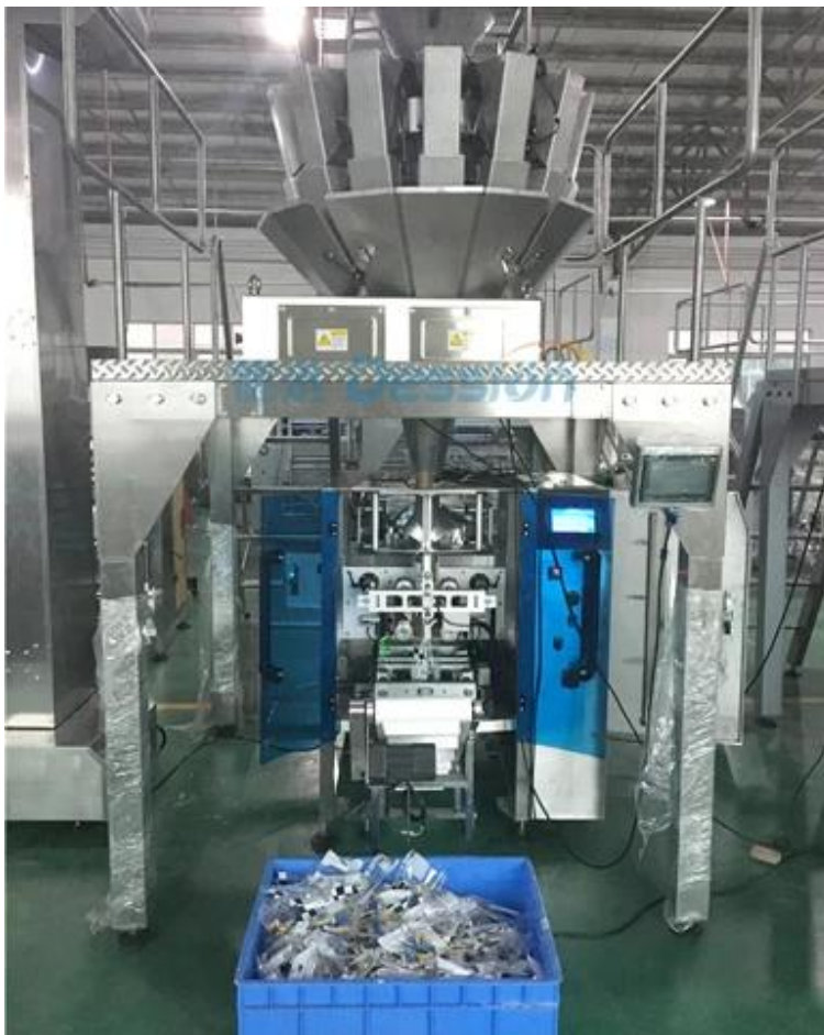
Front Side view