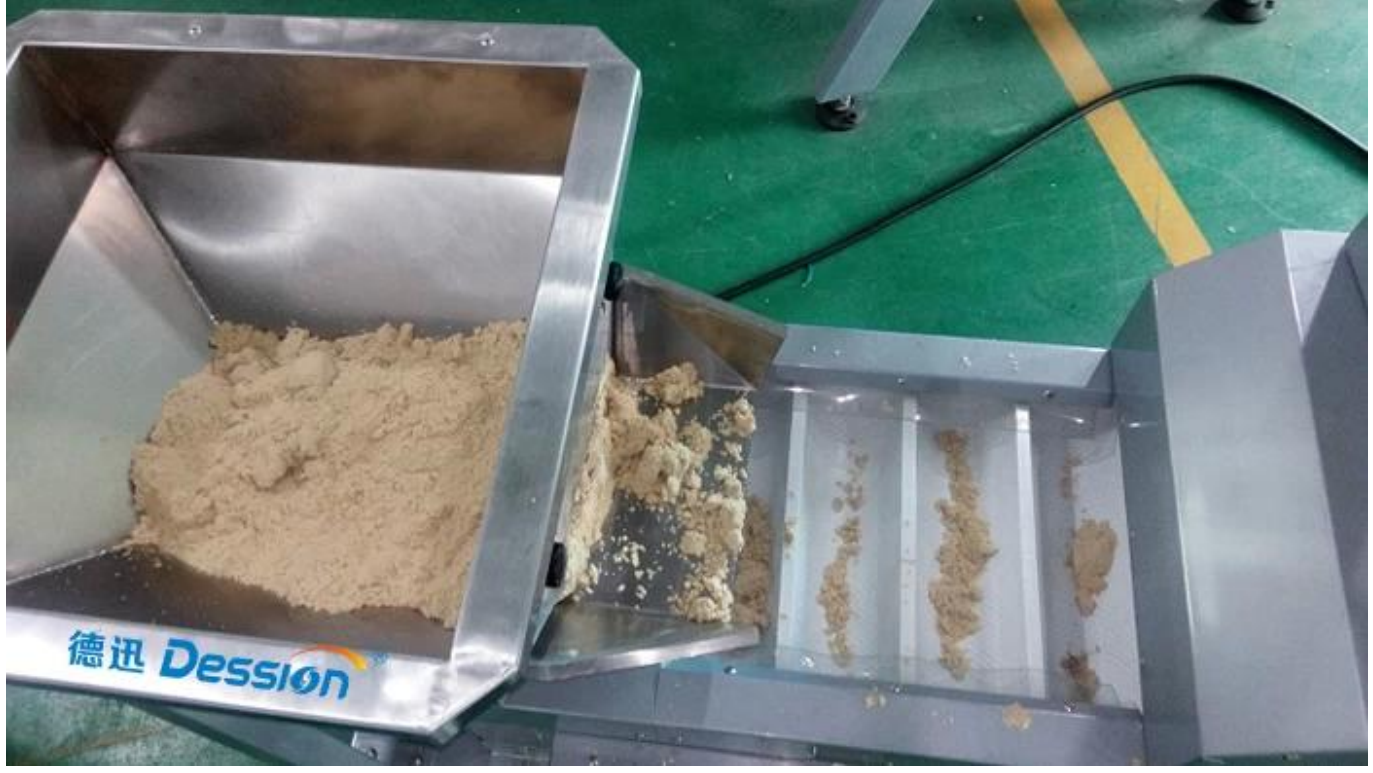
Material Hopper and goes in