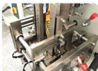
Four Side Sealing Mold