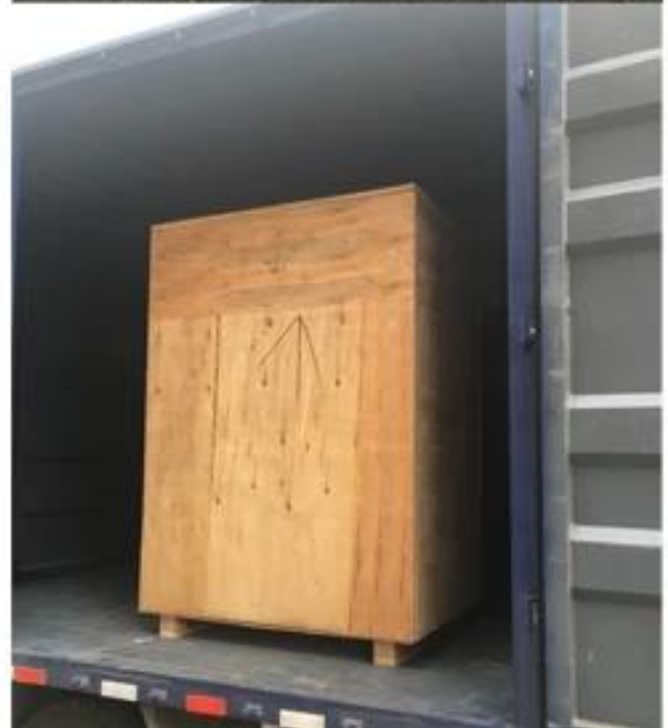
2017 hot new products for 250g 350g 500g 800g salt flow packing machine with screw metering