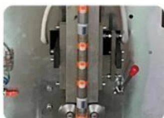
Back Sealing Mold