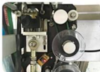
Ribbon Date Printer