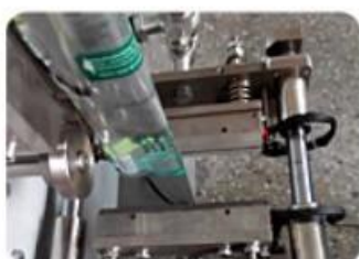
Three Side Sealing Mold