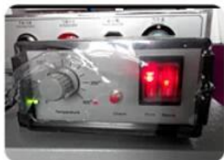
Encoder Heating Device