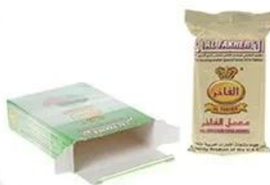
Bag Into Box