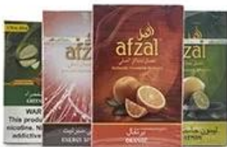
Cellophane & Tear Line Wrap