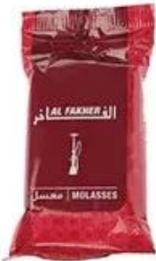
Plastic Bag Packing