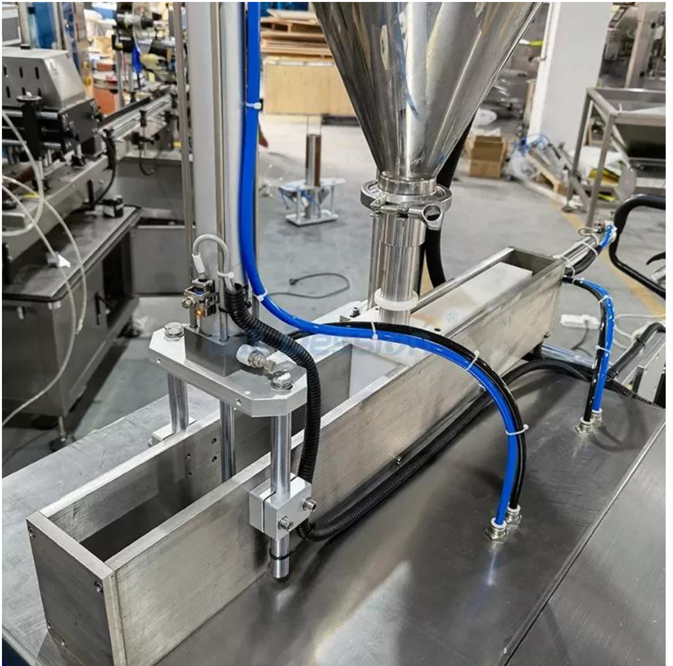
Pneumatic Pump filling