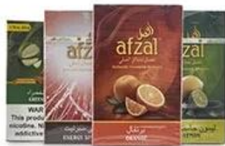
Cellophane & Tear Line Wrap