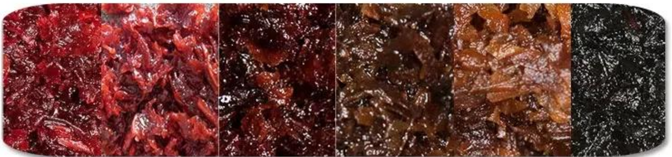
Shisha Tobacco Materail

Dession shisha tobacco packing machine applicable for something stick like shisha , tobacco , hookah and so on.