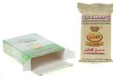
Bag Into Box