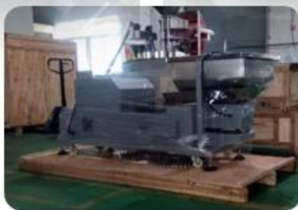
Wapping the Machine