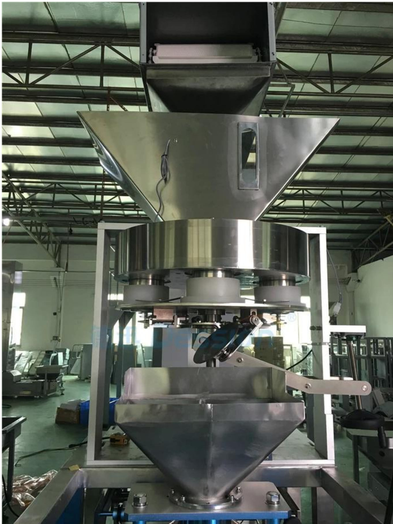
2.Packed itme goes into the cup for metering