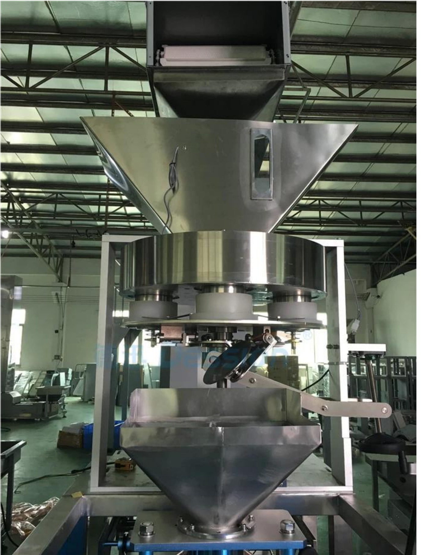
2.Packed itme goes into the cup for metering