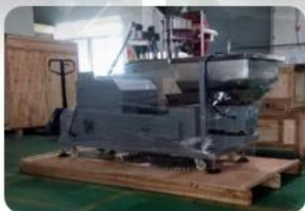
Wapping the Machine