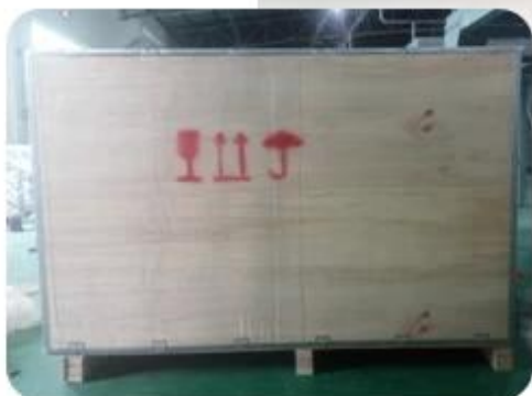
And Put into Wooden Case