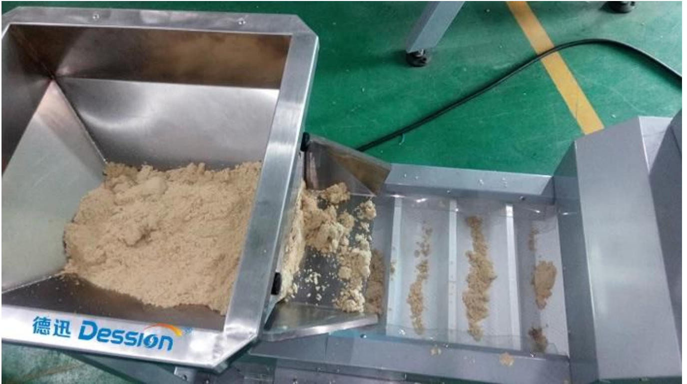
Material Hopper and goes in