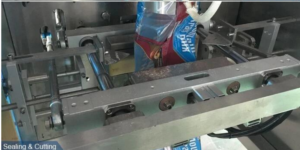
Sealing & Cutting