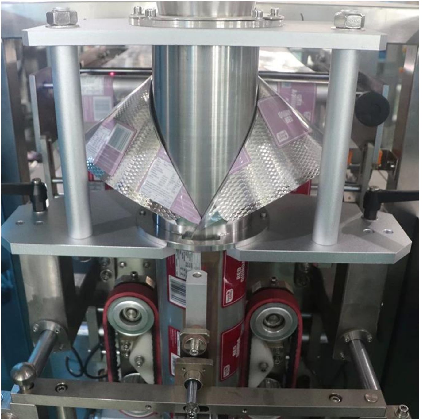
6) End sealing bar seal the bag