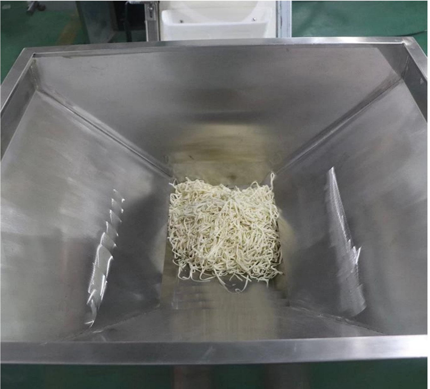
2) Bucket chain