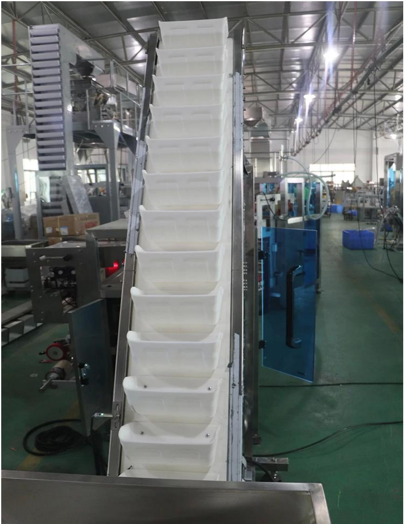
3) Falling down to the hopper