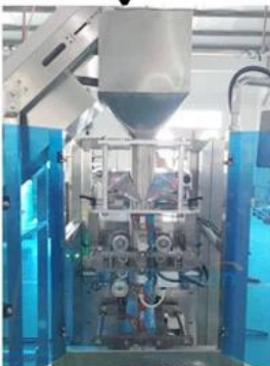
5.Material on Container