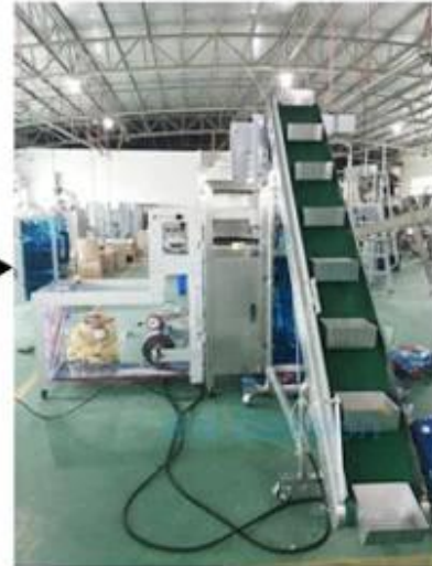
2.Material goes up by the chain