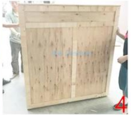
Automatic perforating tea bag and instant coffee machine packing