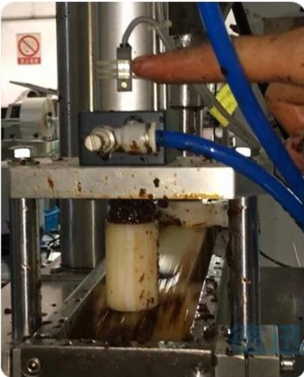
hookah measuring and filling