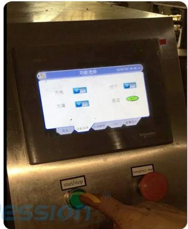
press start button