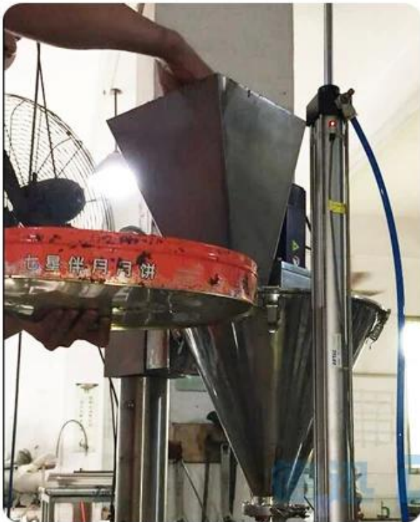
feed hookah into hopper