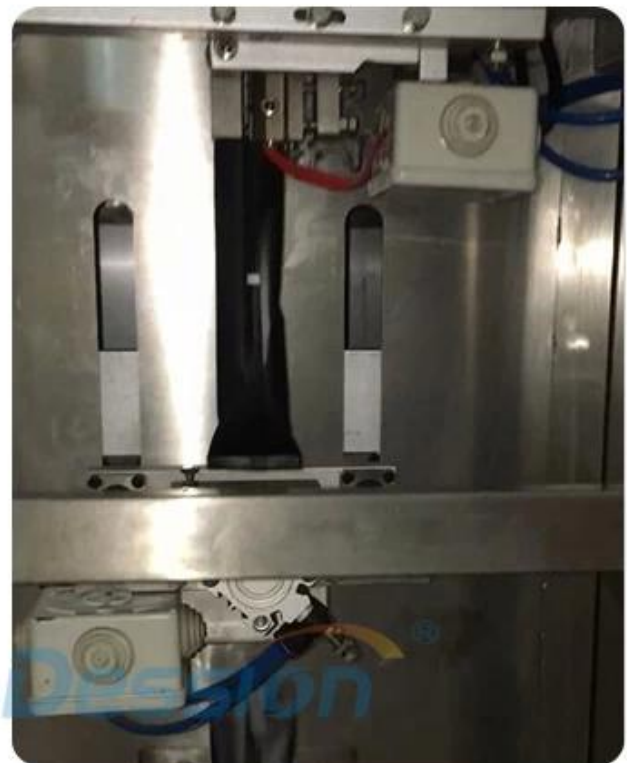
bag forming and sealing