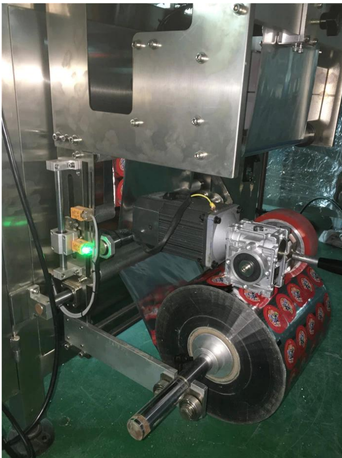
Machine Working Process: