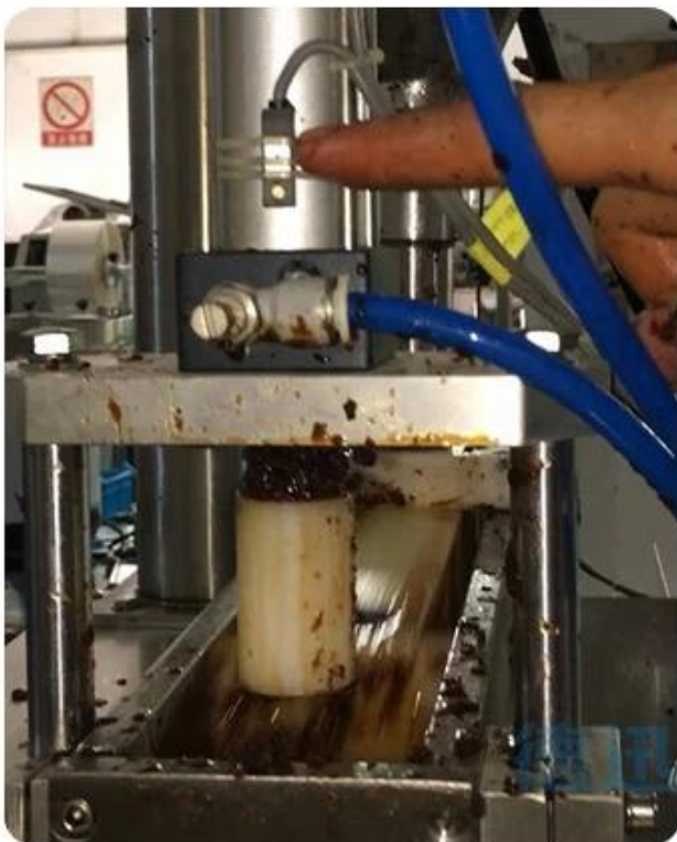
hookah measuring and filling