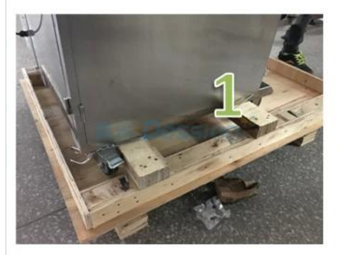
1. Put the machine on the carton