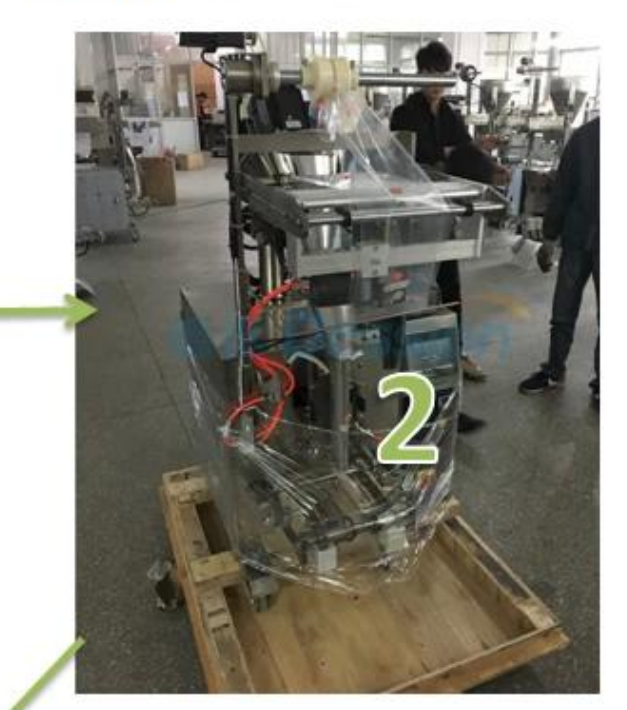
2. Wrapping the machine