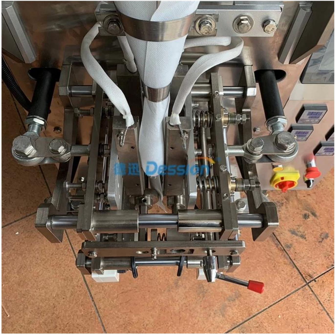
Handbag Form sides