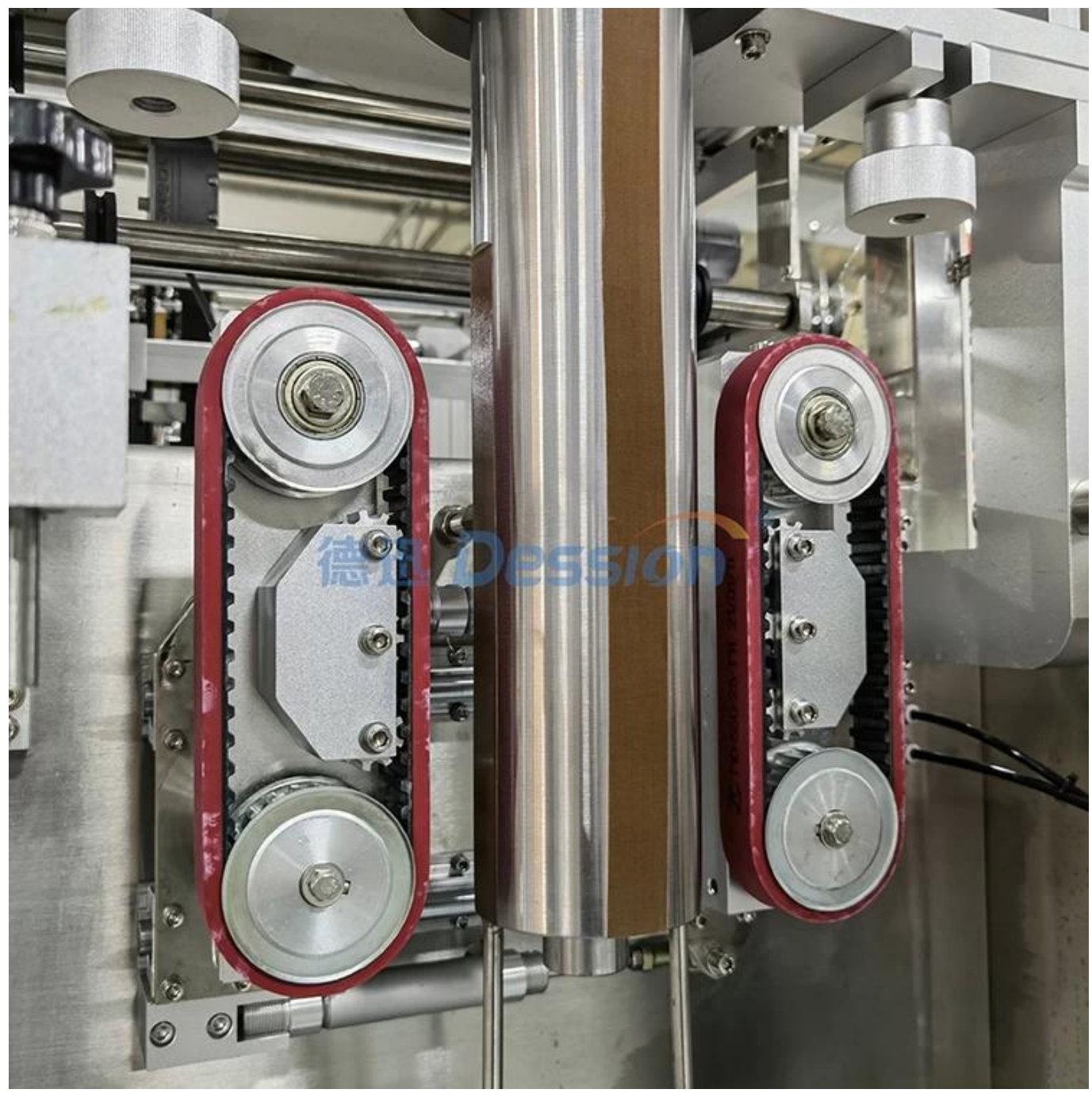
Sealing part and bag maker