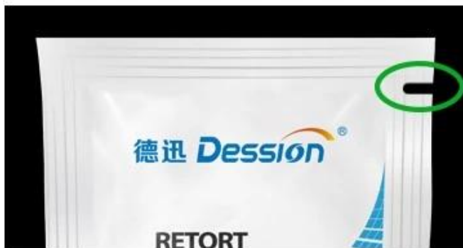
Bag with easy to tear