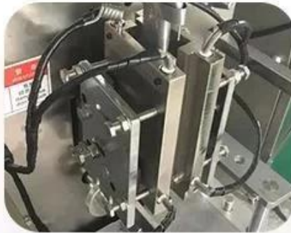
4 Sides Sealing Device