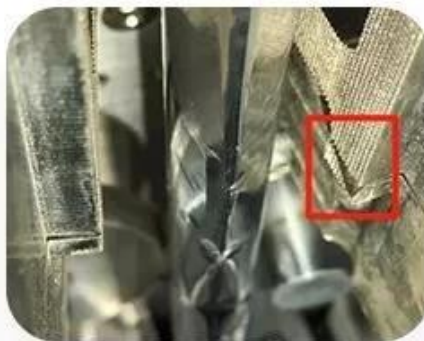
Easy Tearing Device