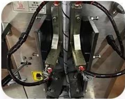
3 Sides Sealing Device

Depending on your needs, you can choose to replace or add the following configuration. For example, 3 sides sealing device, 4 sides sealing device, linking bag device, gas-filled device, easy tearing device and hole device.