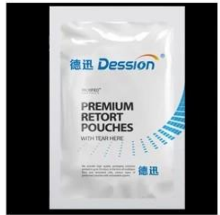
4-Sides Sealing Bag