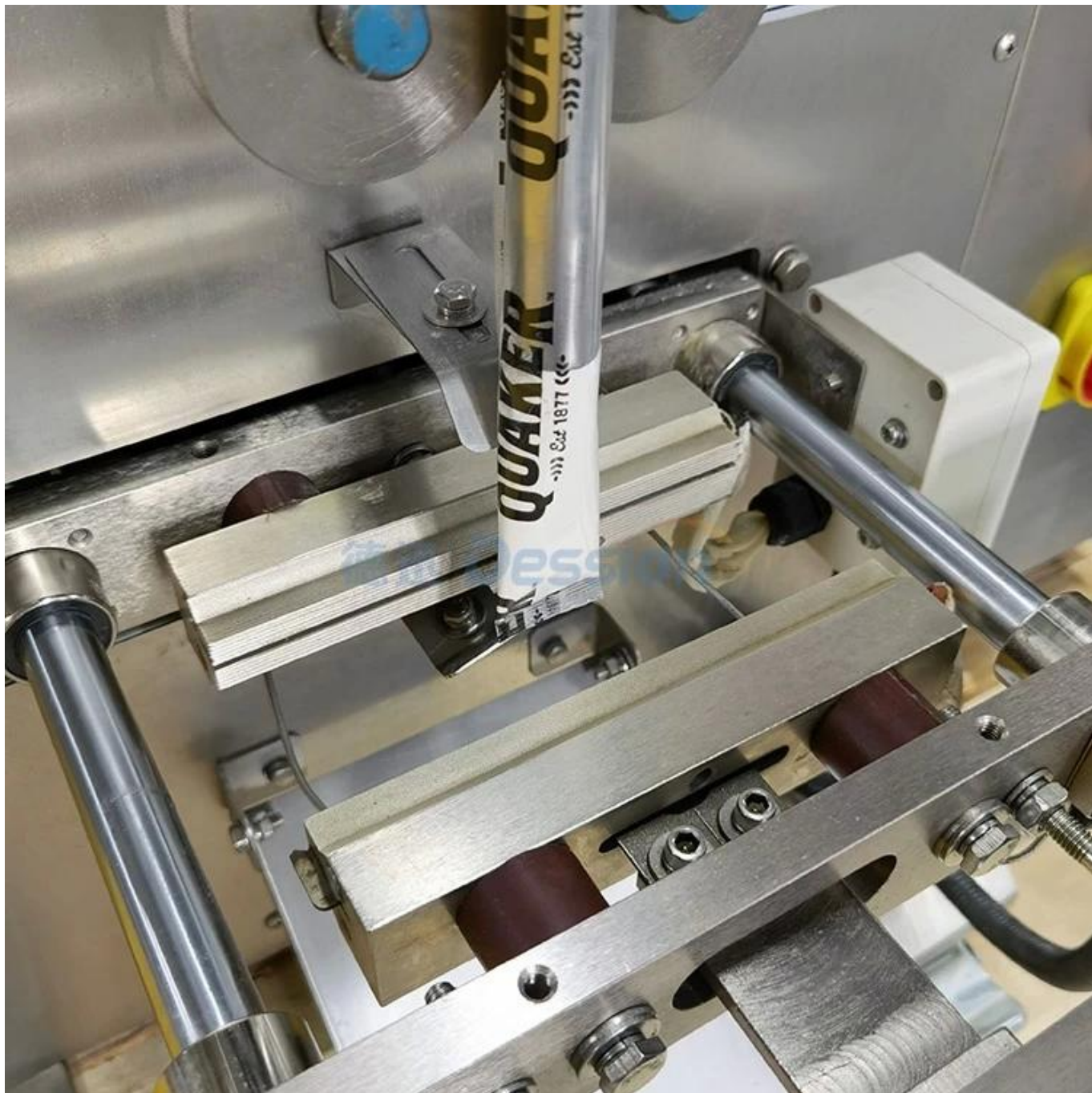
Bag cutting device