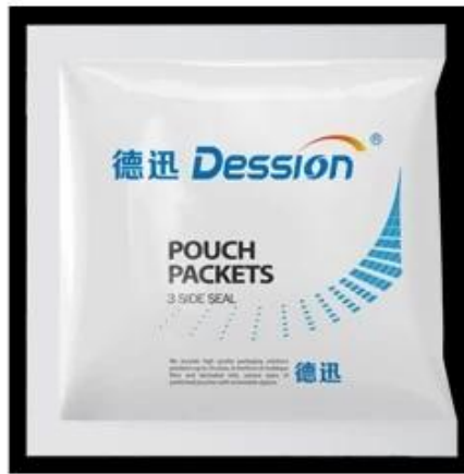
3-Sides Sealing Bag