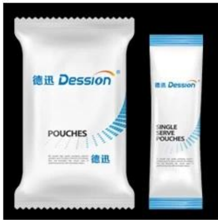
Back Sealing Bag