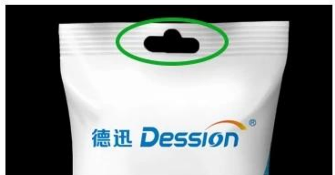
Bag with hole