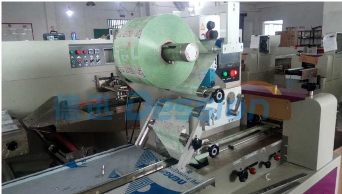
Pull the film