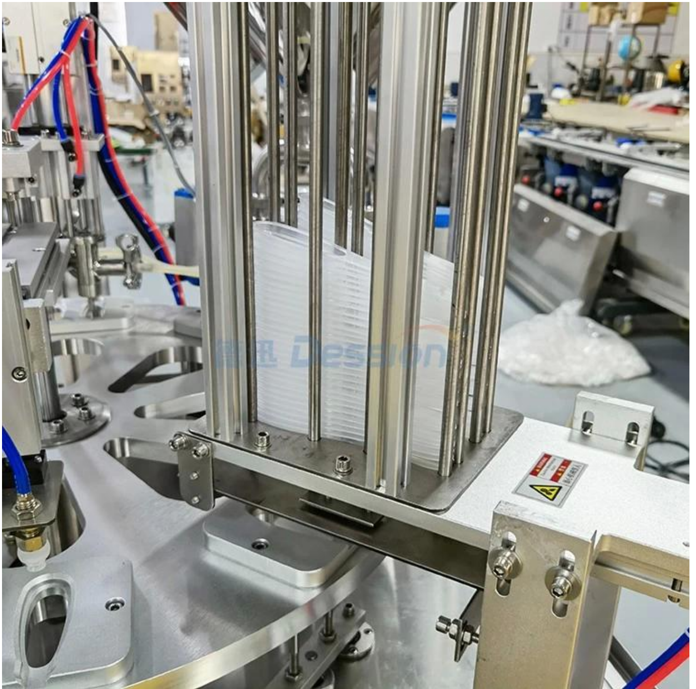
Spoon release device