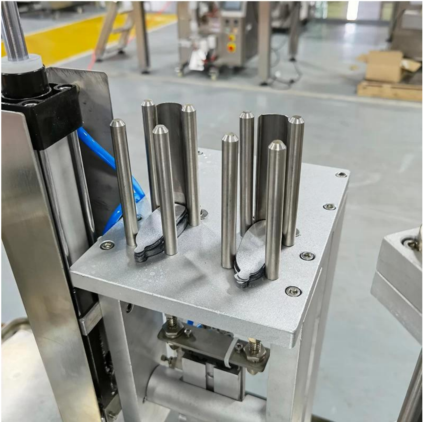
Film release device