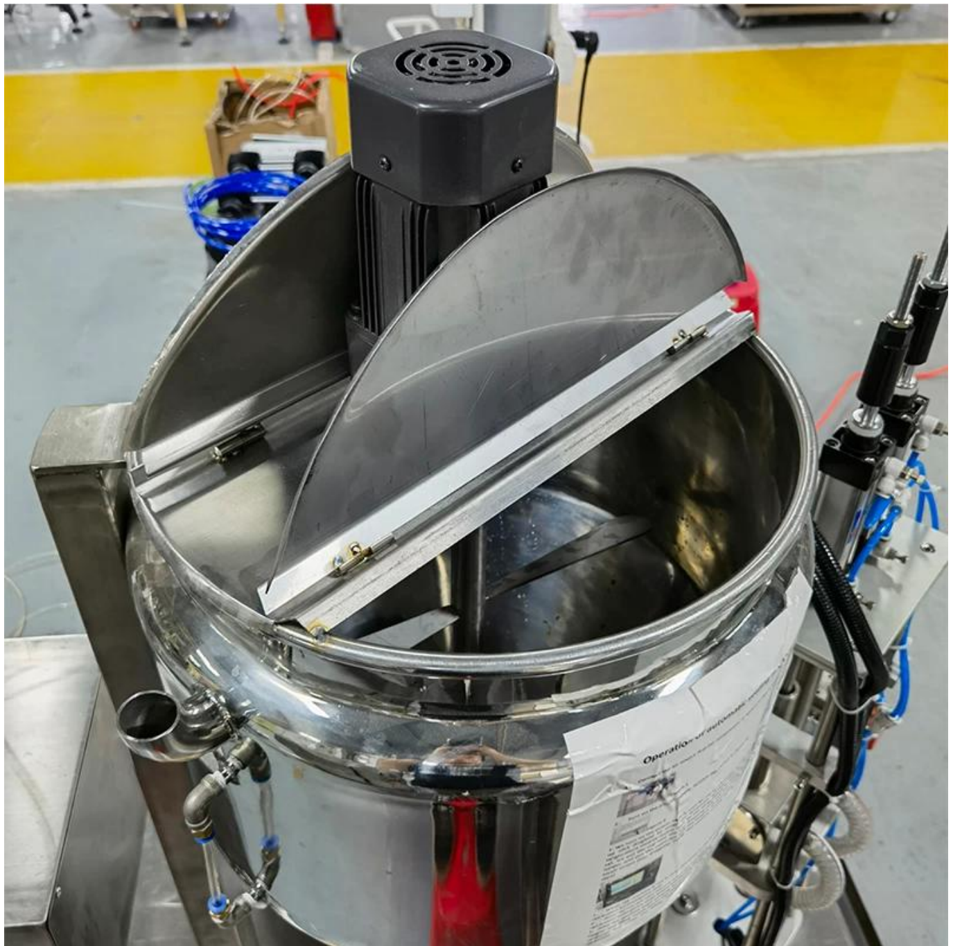
Stir and heat