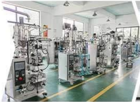
SMALL VERTICAL WORKSHOP