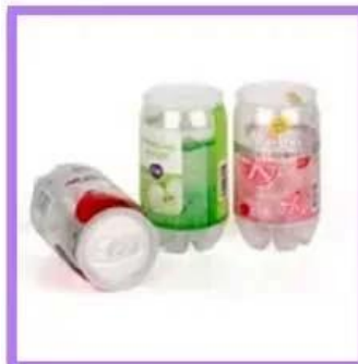
Jar & Can