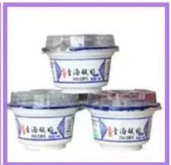
Cup & Bowl