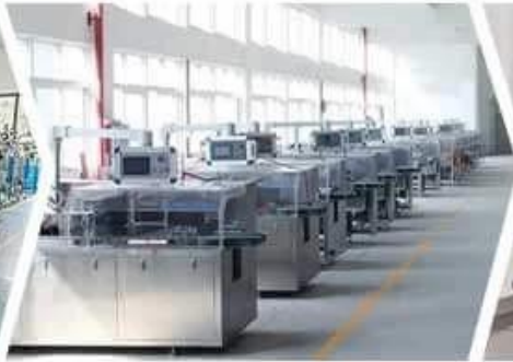
CARTONING MACHINE WORKSHOP