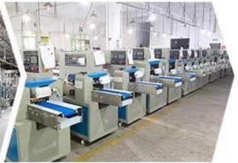
PILLOW MACHINE WORKSHOP