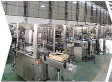
FILLING MACHINE WORKSHOP