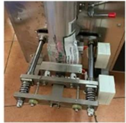
Bag Cutting Device