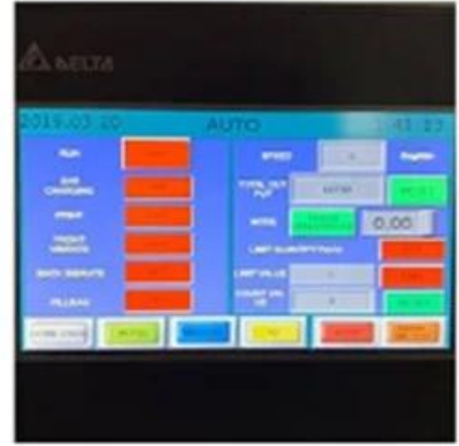
Touch Control Screen