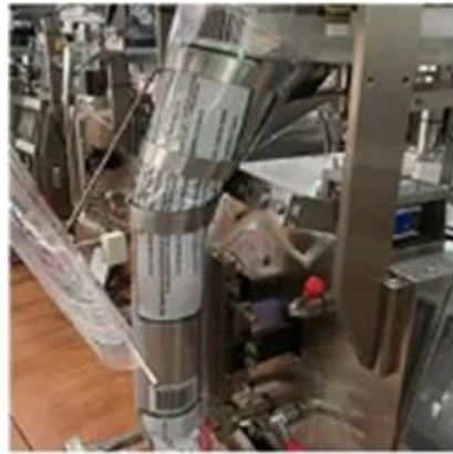
Bag Former and Bag Sealing Device