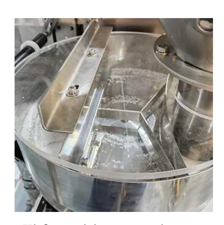
High-precision measuring cup device