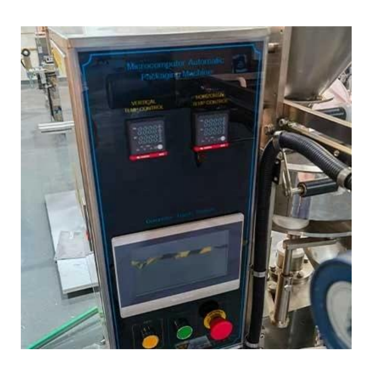
Smart touch screen