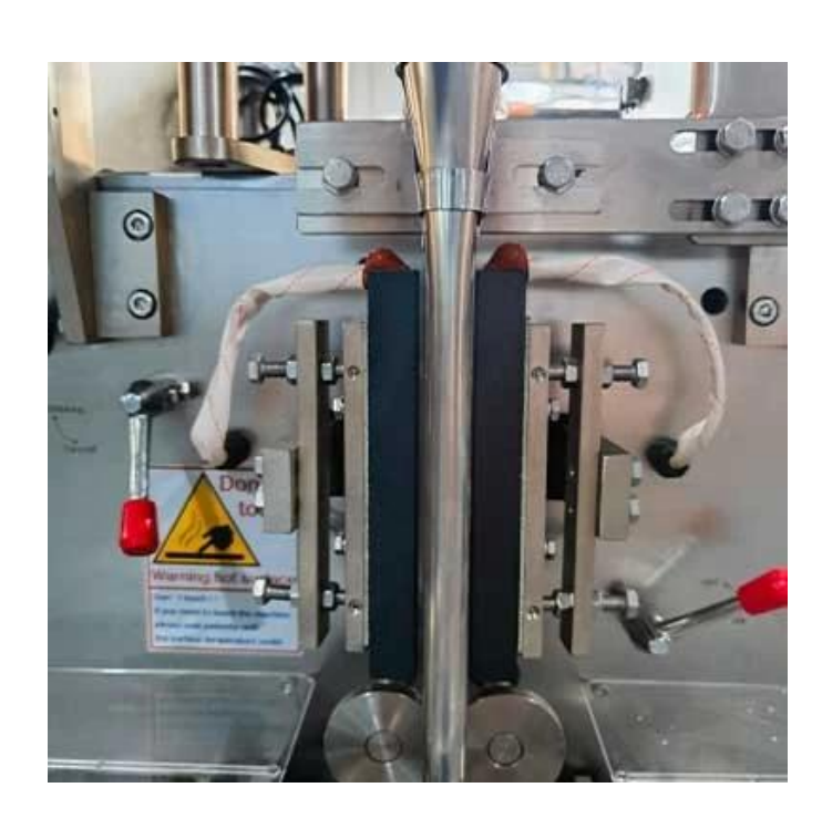
Bag sealing device