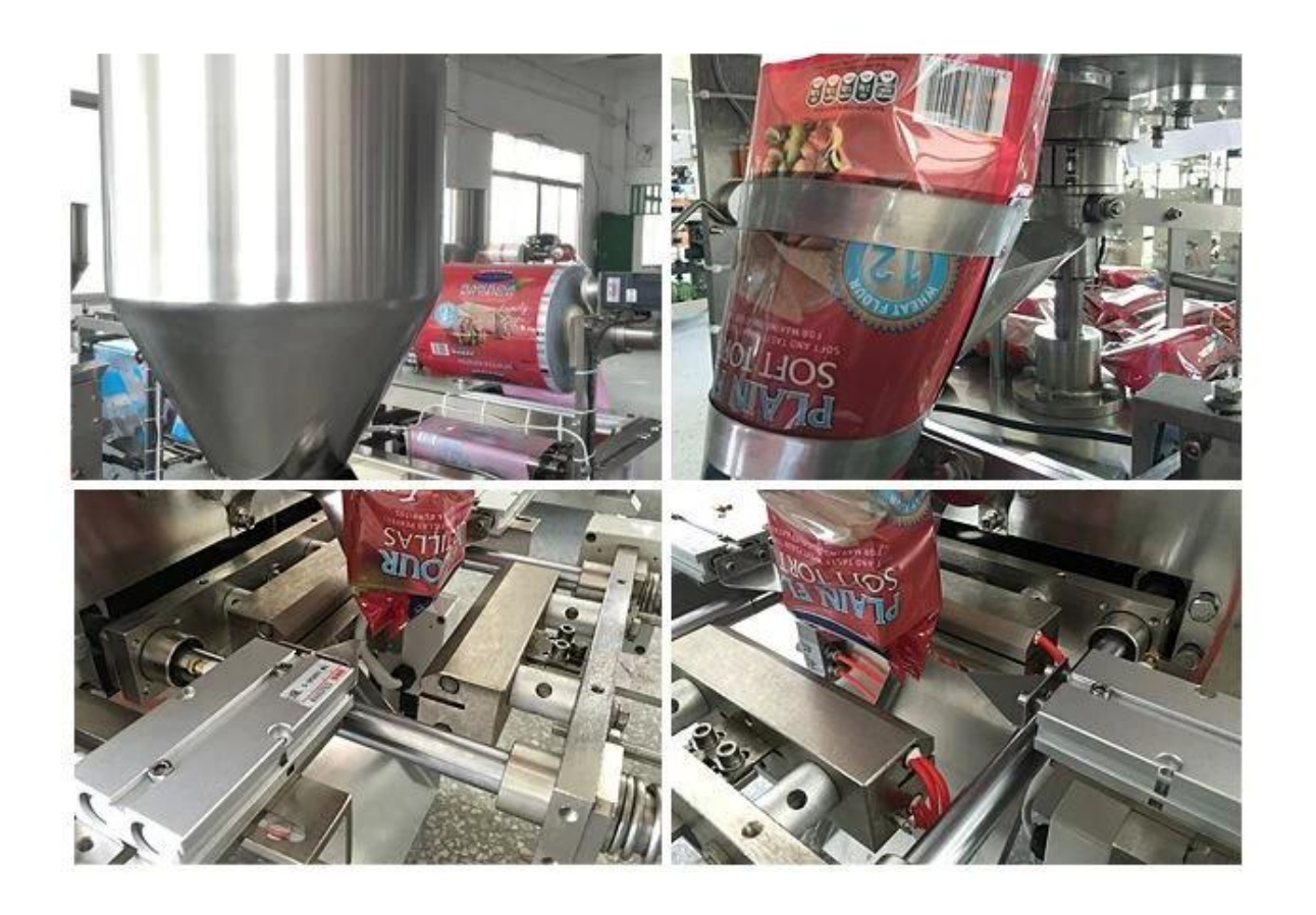
same 304# stainless steel material, Our Dession, offer you 360 different surface treatment