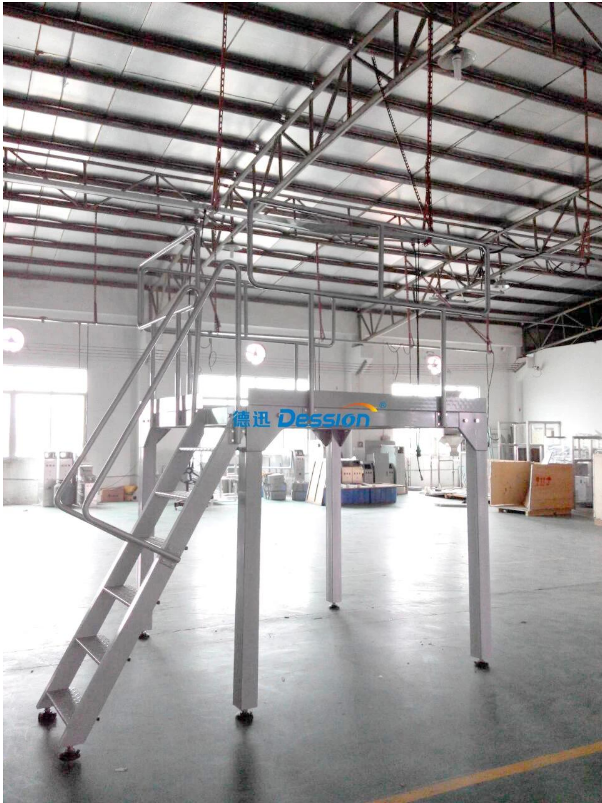
4.Z type bucket elevator(with vibration feeder)