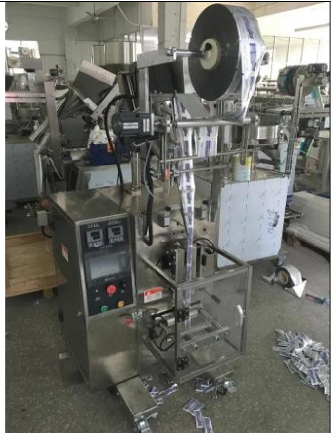
LEFT SIDE OF THE MACHINE