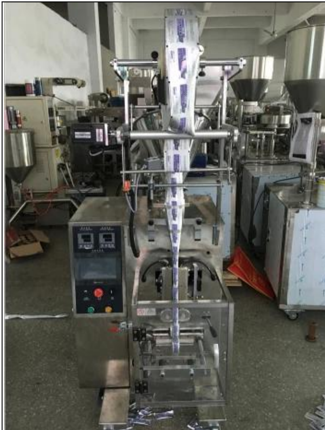
FRONT OF THE MACHINE