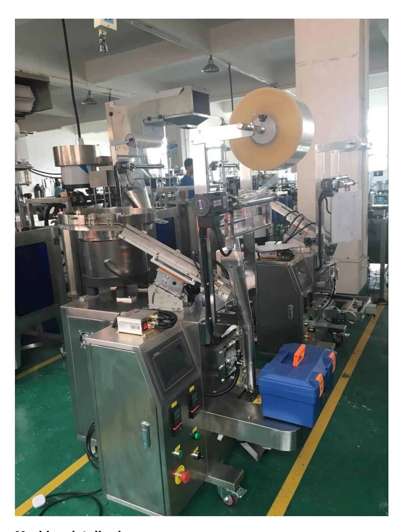
Machine details show: