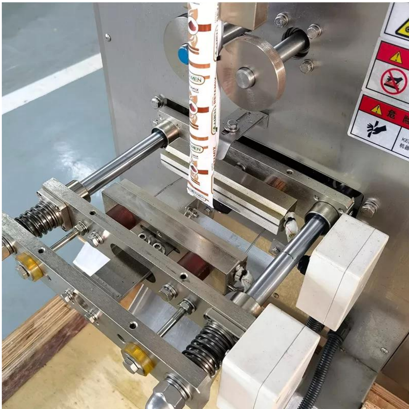
Bag cutting device