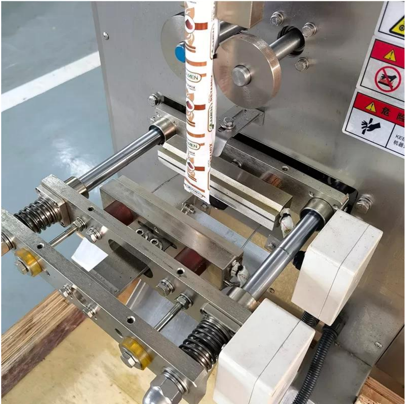
Bag cutting device