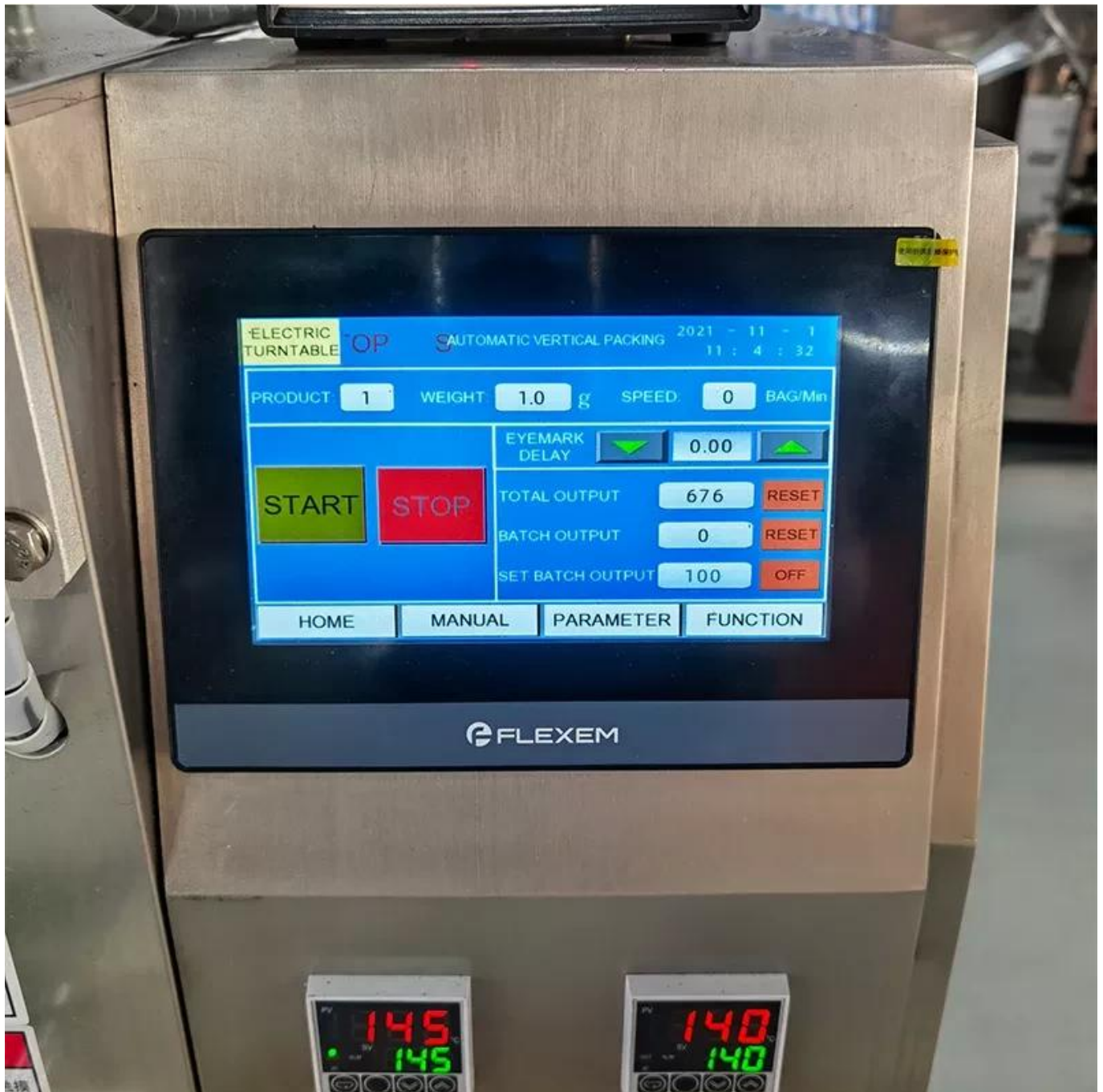
Touch control screen