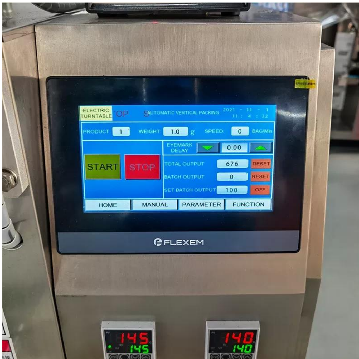
Touch control screen