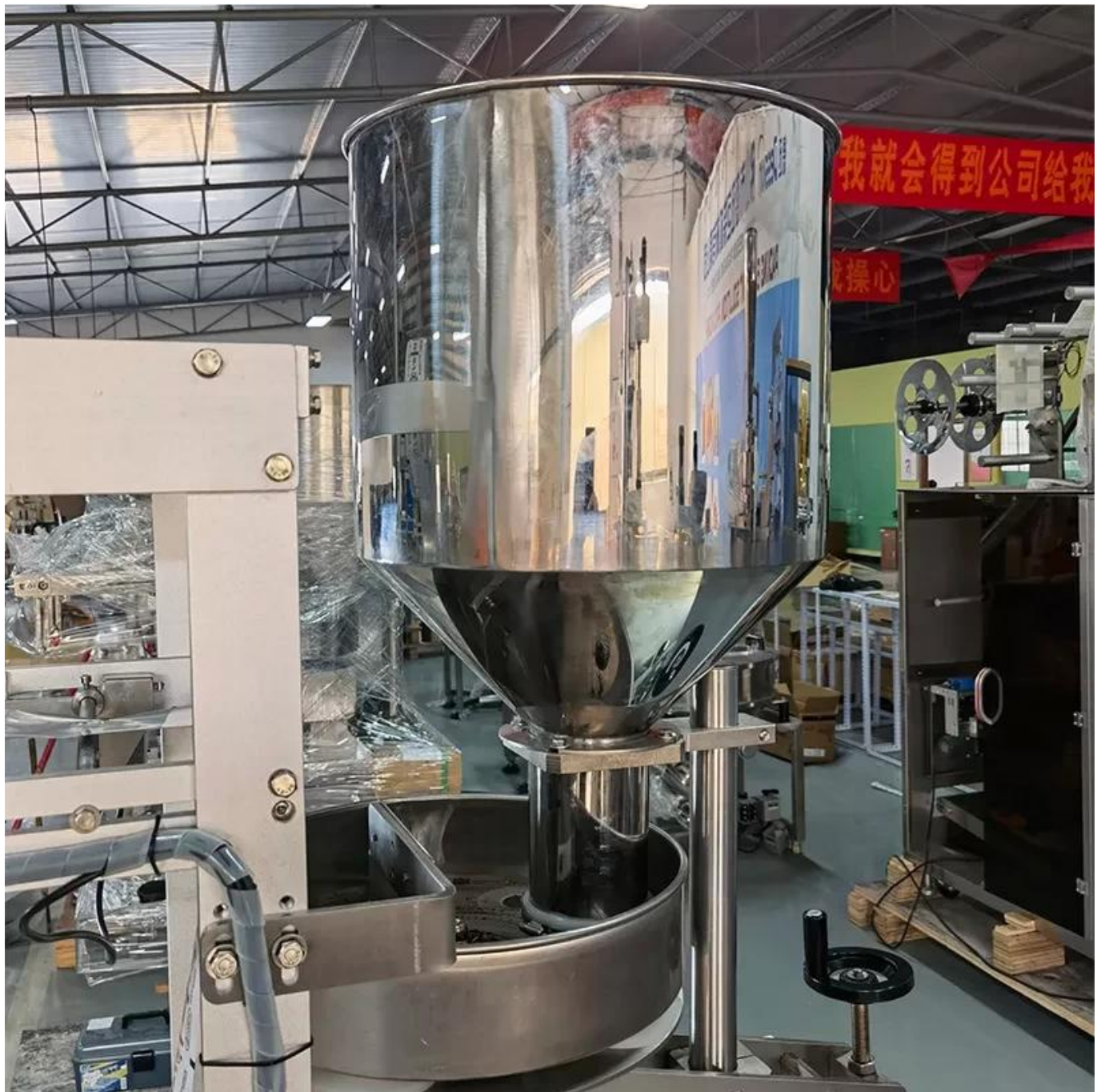
Hopper and measuring cup