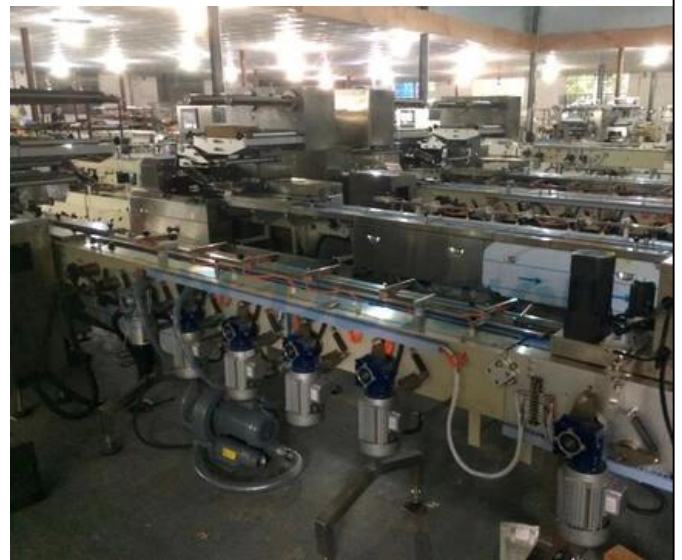
LOCAL AREA OF THE MACHINE