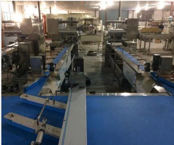
LOCAL AREA OF THE MACHINE