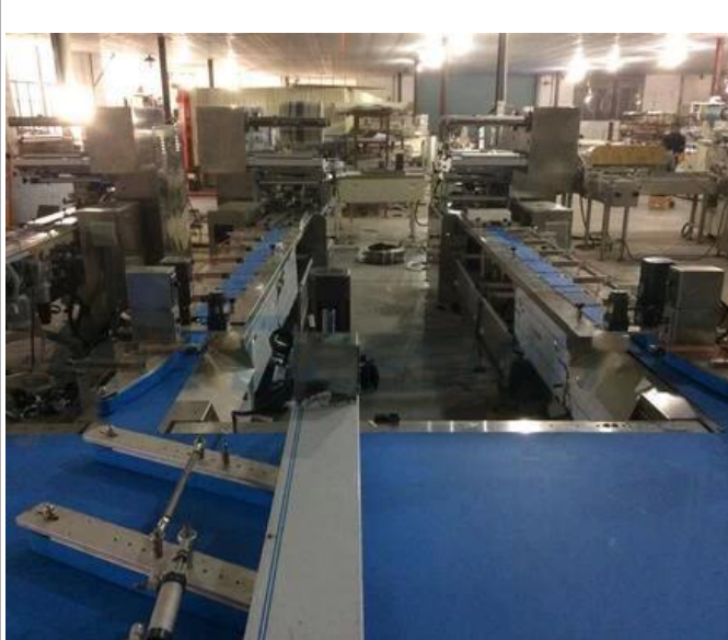
LOCAL AREA OF THE MACHINE