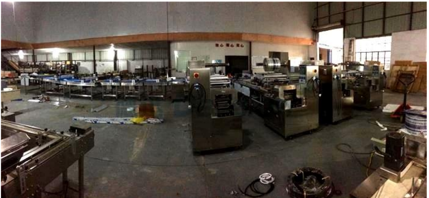
BEHIND THE MACHINE