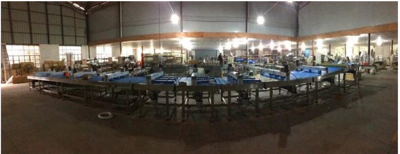
FRONT OF THE MACHINE