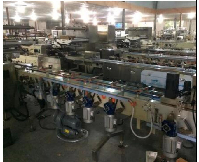
LOCAL AREA OF THE MACHINE