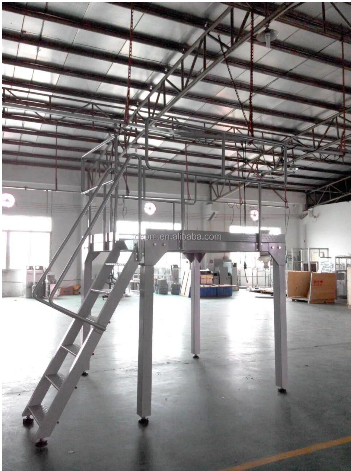
4.Z type bucket elevator (with vibrating feeder)