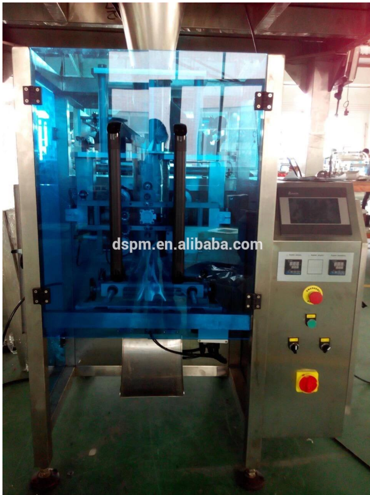
3. Support platform