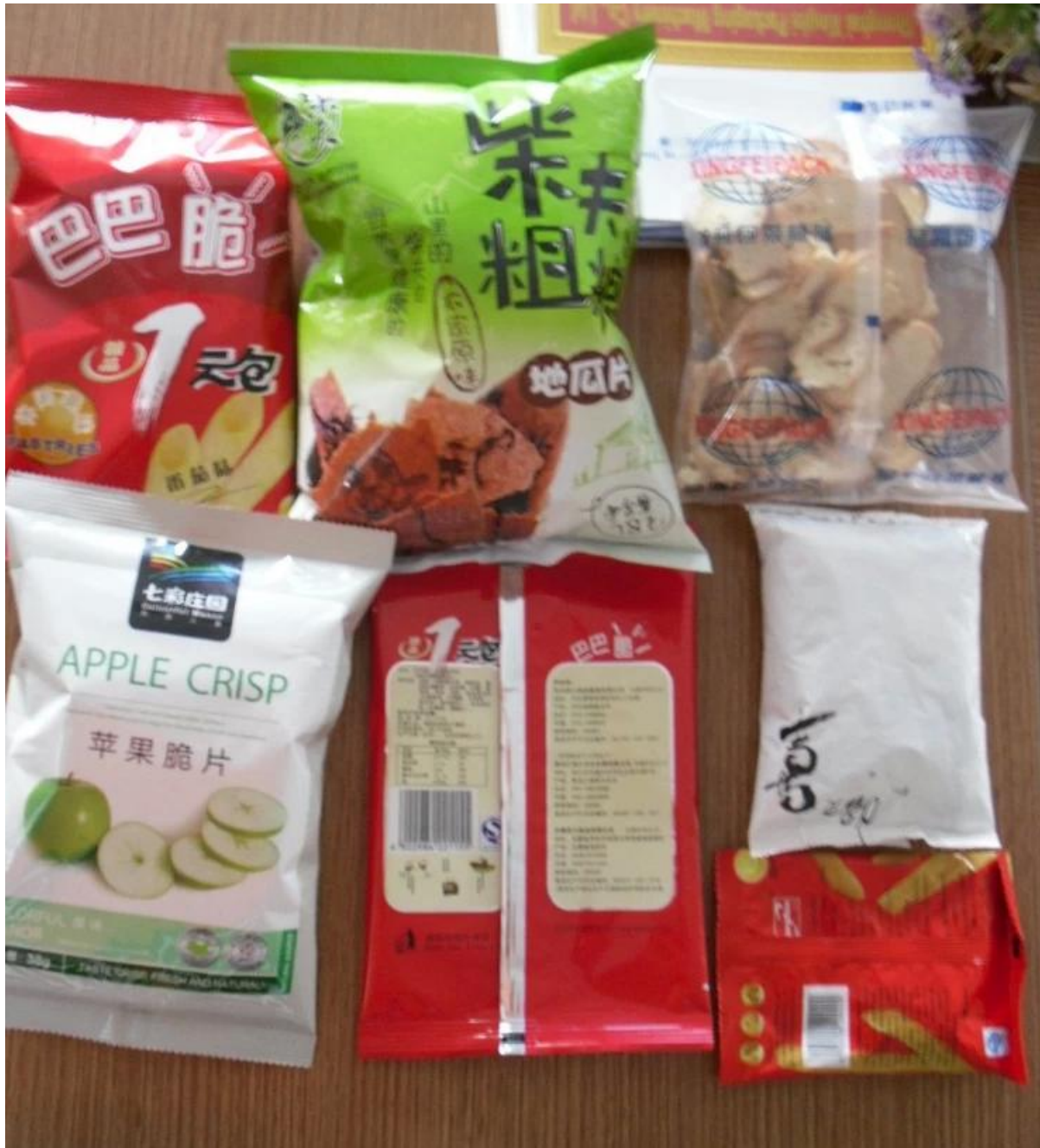
Automatic weighing and wrapping machine parts show: