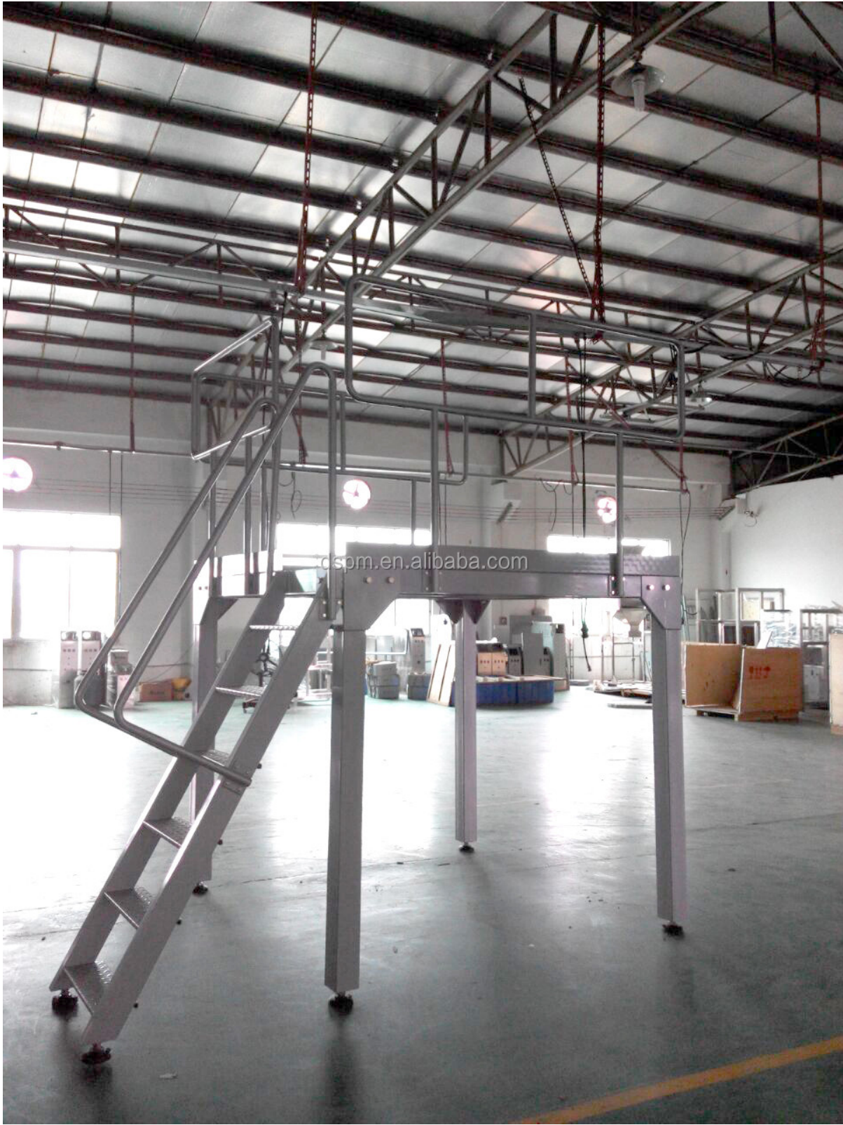
4.Z type bucket elevator (with vibrating feeder)