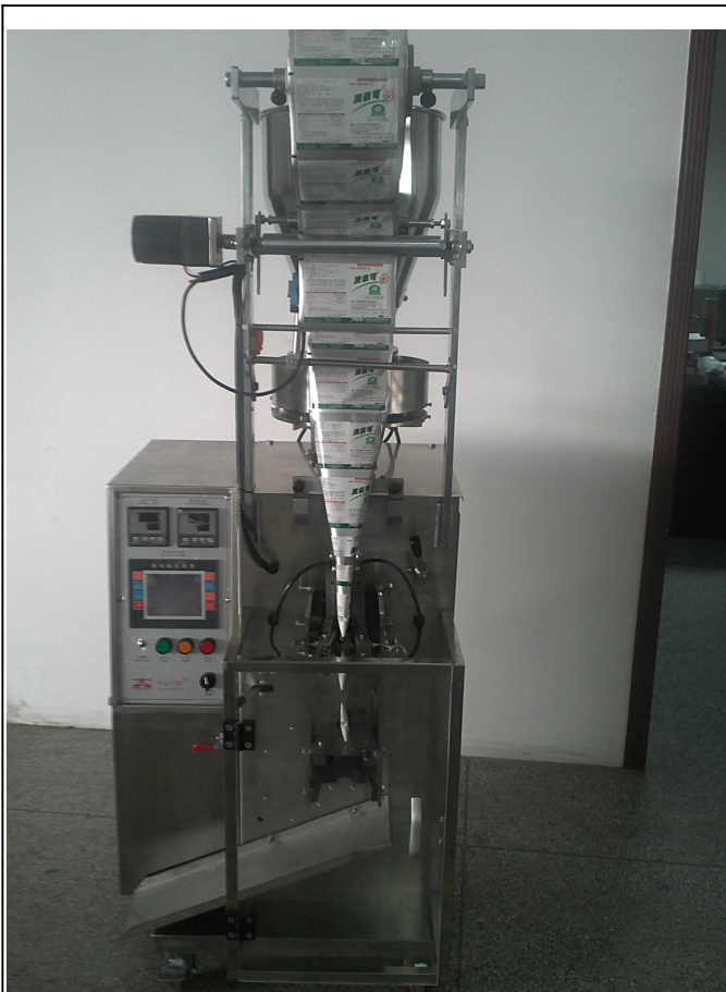
FRONT OF THE MACHINE