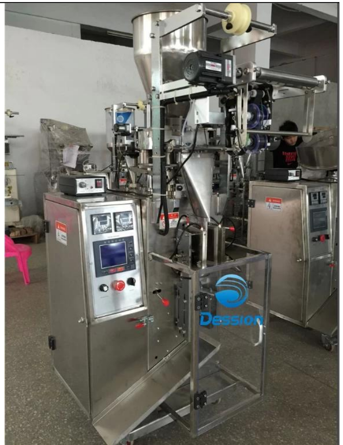
LEFT SIDE OF THE MACHINE