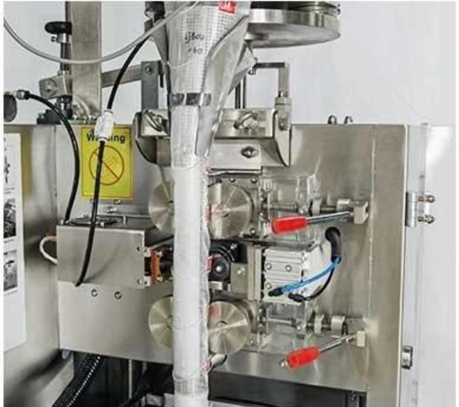
The roller is accurate and stable, and the service life is long.