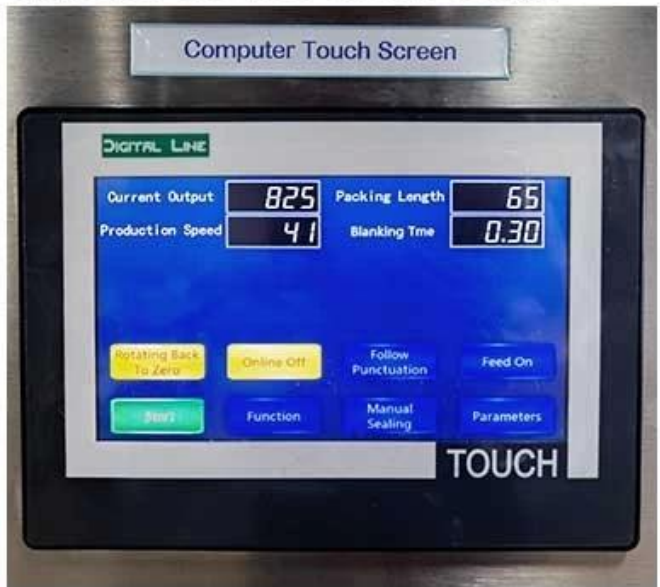
Simple operation of Chinese and English settings