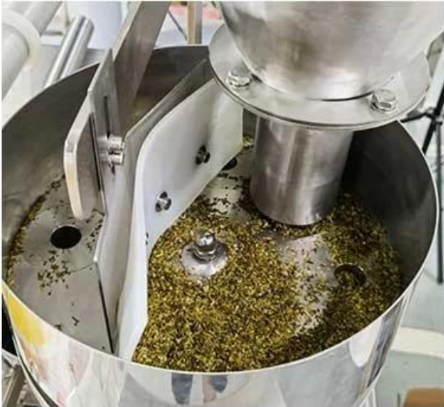
Put the tea leaves into the machine and stir them.