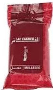
Plastic Bag Packing