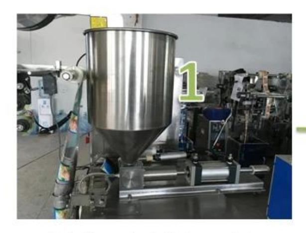
1. Put the material to container