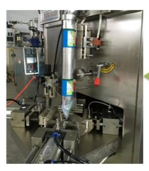
5. Bay Making