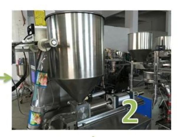
2. Pump measuring