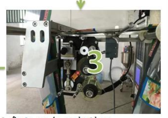
3. Date code printing