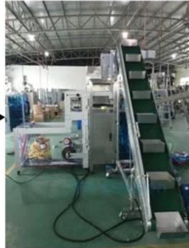
2.Material goes up by the chain