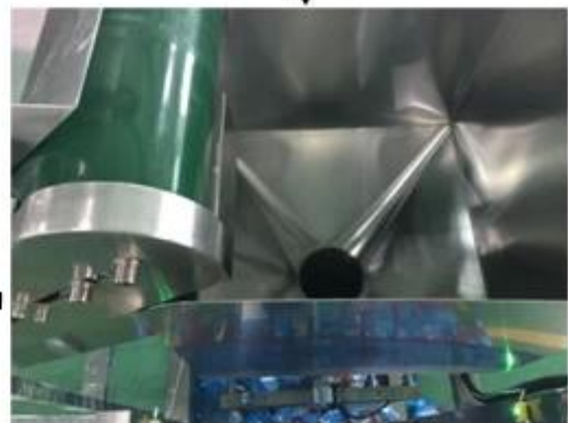
3.Material goes into the Container