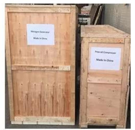
Wooden Box Packing