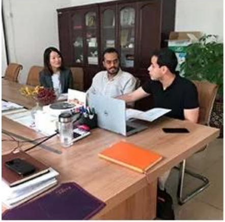
Collect Customer Needs