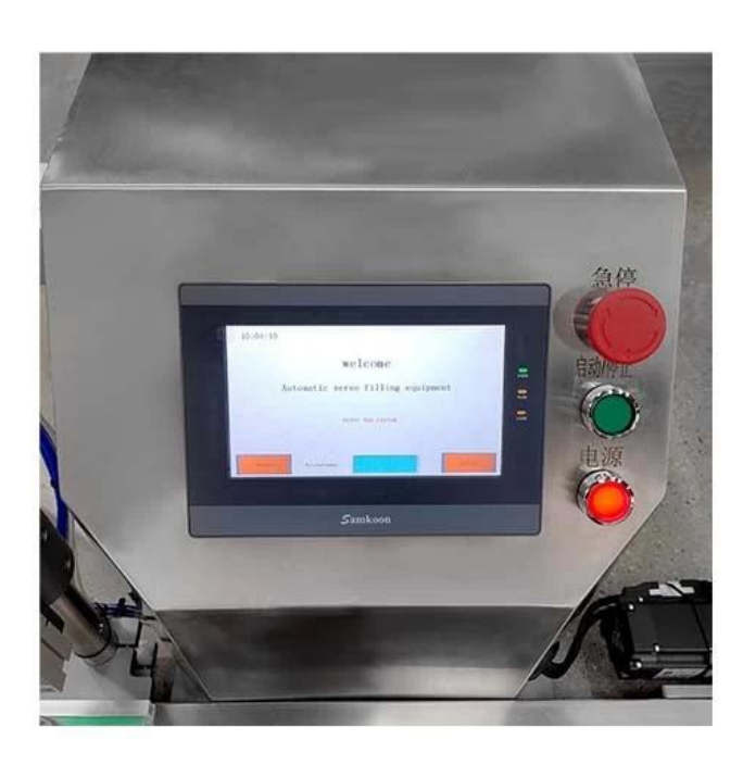
PLC control panel