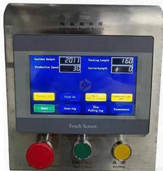
Touch screen control and temperature display part