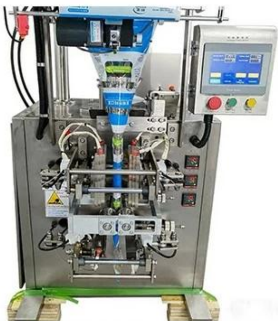
Packaging bag heat sealing knife