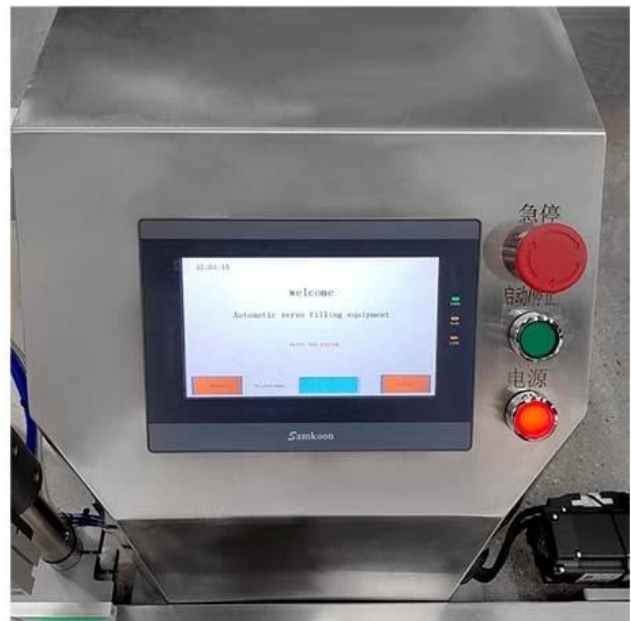
PLC control panel