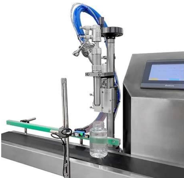
Cylinder (equipped with a leak stop valve)