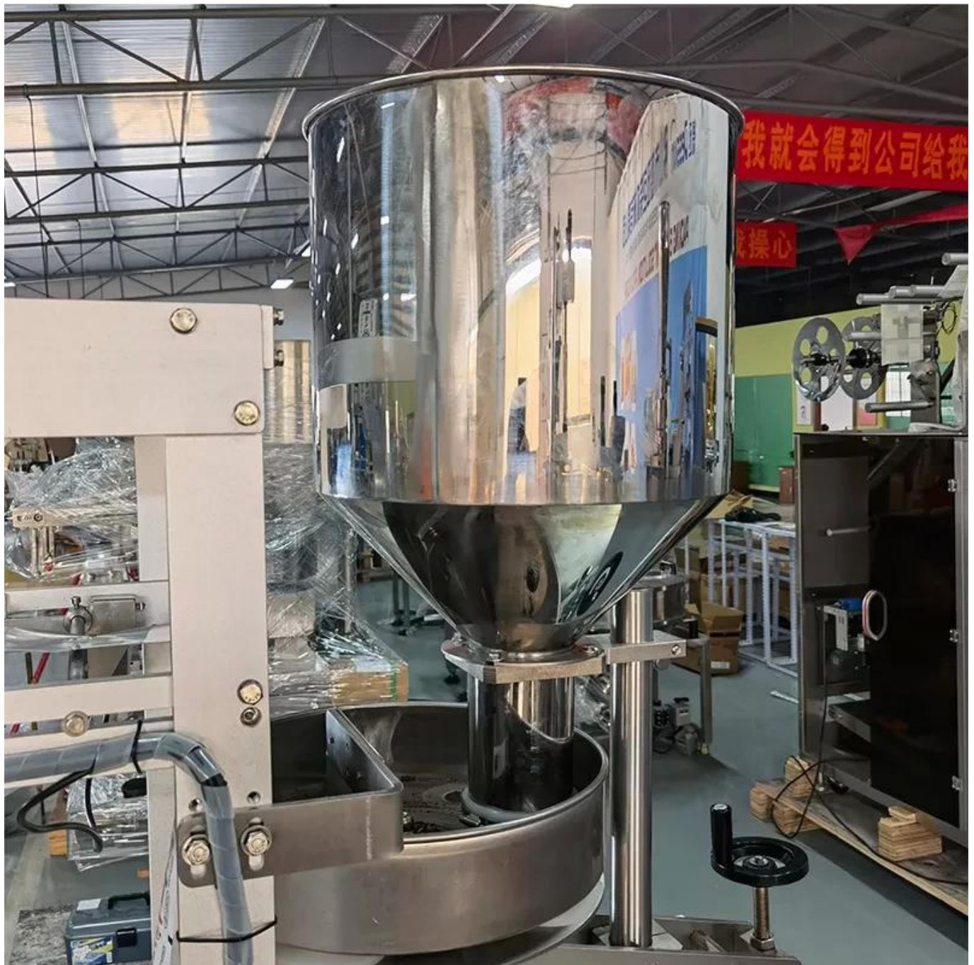
Hopper and measuring cup