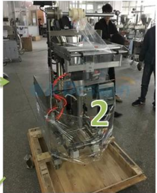
2. Wrapping the machine