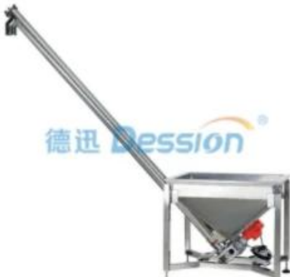
Machine Main Parts