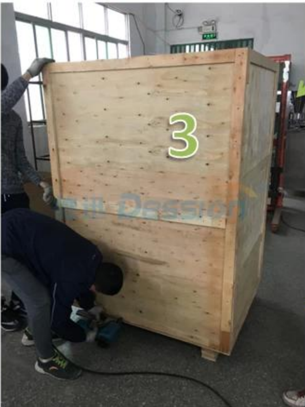
3. Sealing the carton