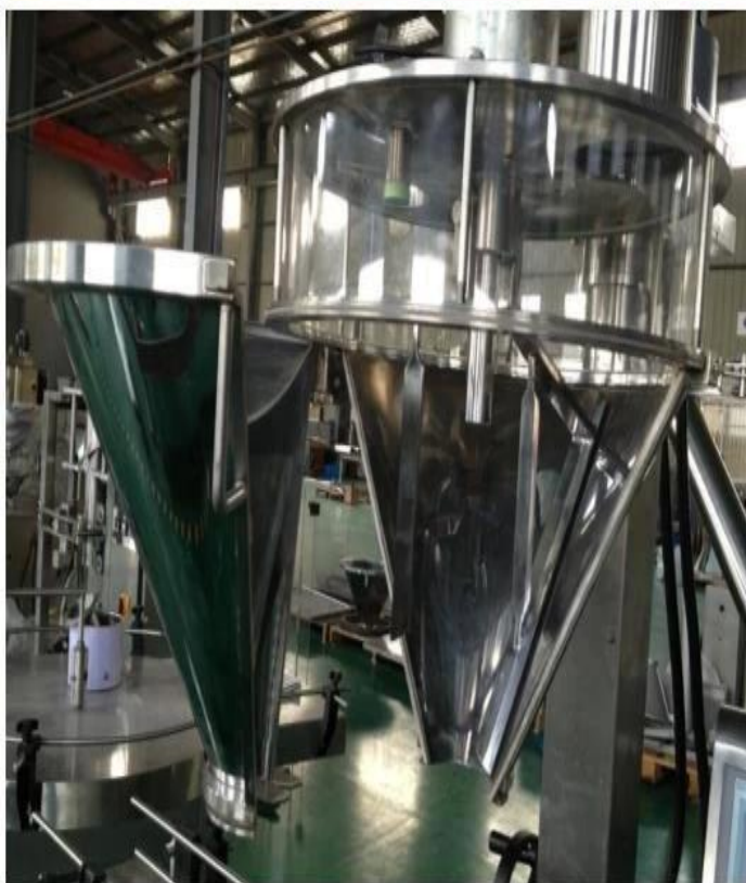
Auger Filler (If you have different packing weight , you need change this auger.)