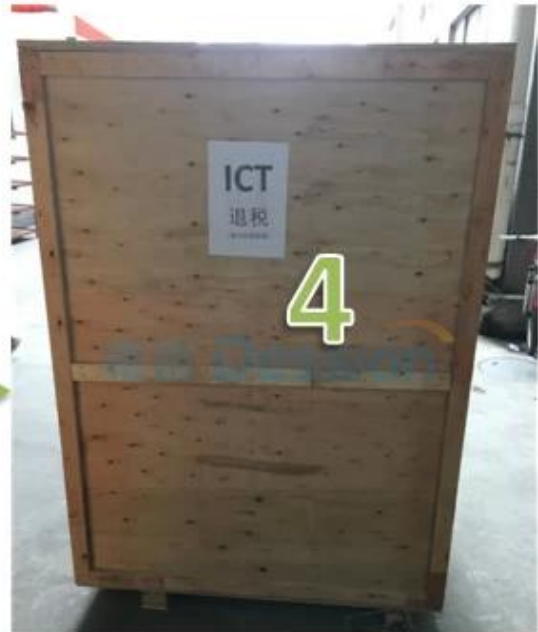
4. Waiting for shipping