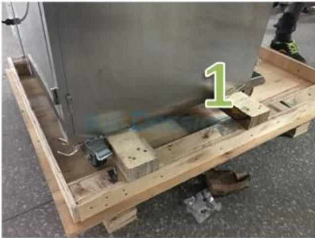
1. Put the machine on the carton