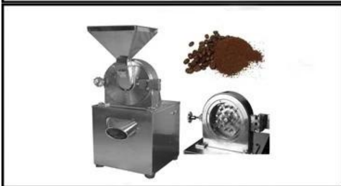
Mixer /Mixing Machine