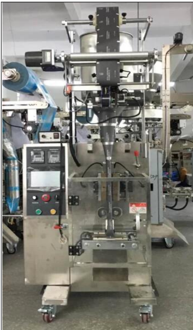
FRONT OF THE MACHINE