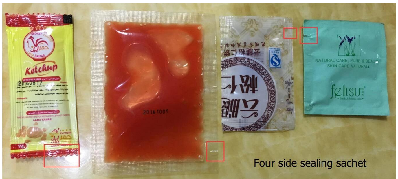
Four side sealing sachet