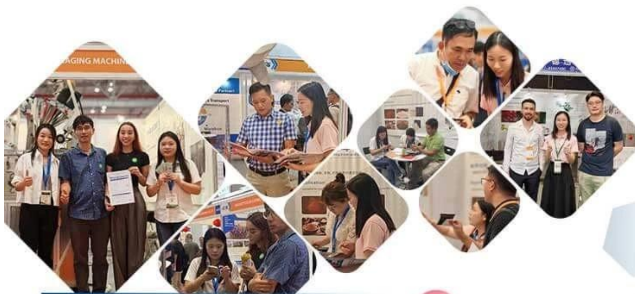
▶ International exhibition