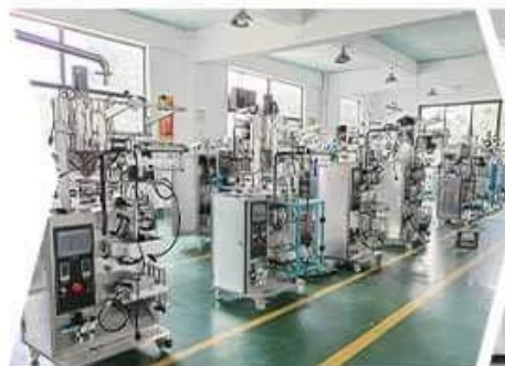
SMALL VERTICAL WORKSHOP