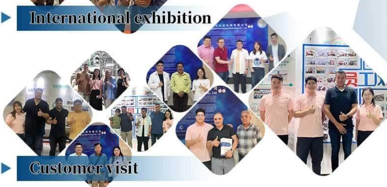
▶ Customer visit