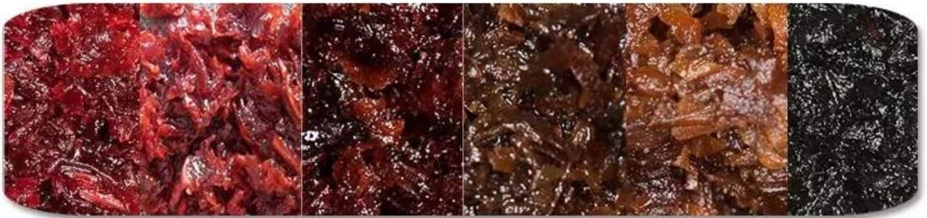
Shisha Tobacco Material