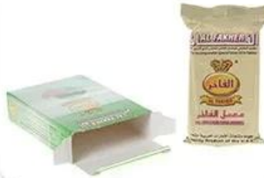
Bag Into Box