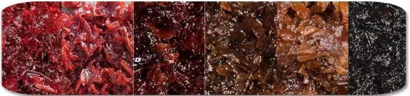
Shisha Tobacco Materail