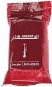
Plastic Bag Packing