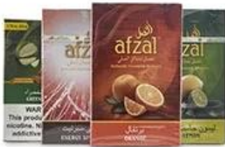
Cellophane & Tear Line Wrap