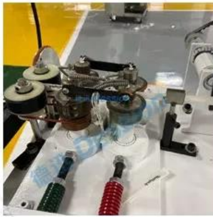
Bag sealing device