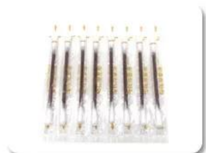
Sterile Cotton Swab