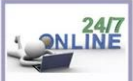
7-24 Hours services