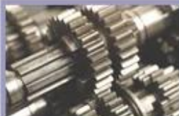
High quality material