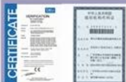
Tight quality control