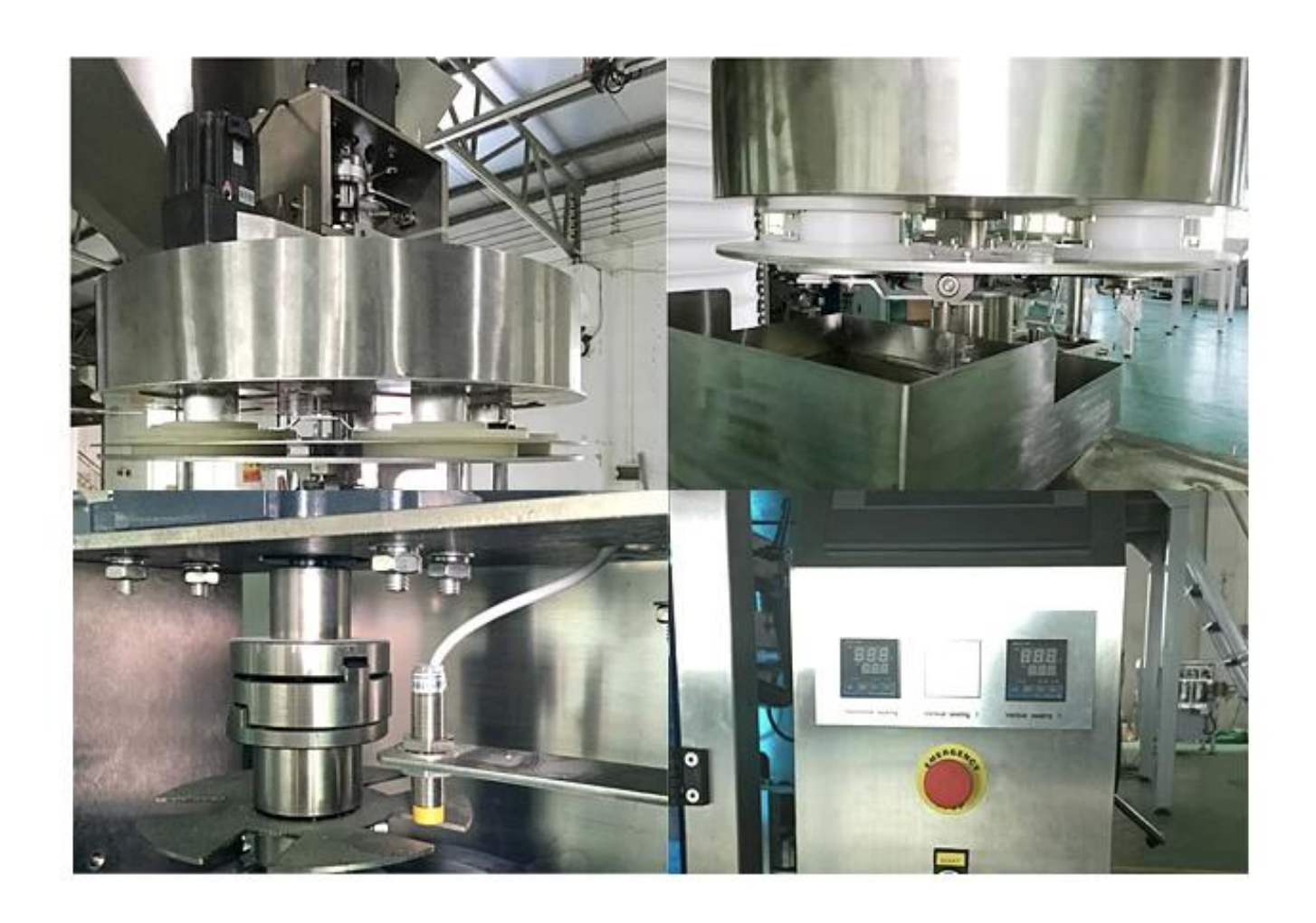
same 304# stainless steel material, Our Dession, offer you 360 different surface treatment