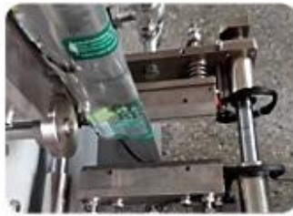
Three Side Sealing Mold