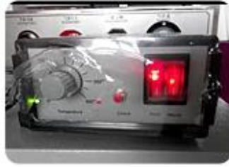
Encoder Heating Device