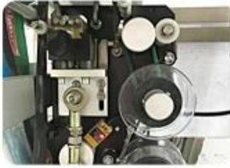
Ribbon Date Printer