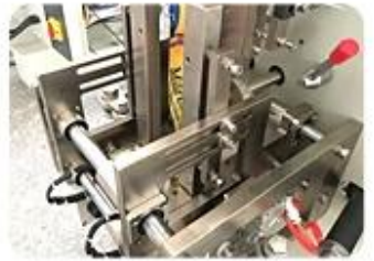
Four Side Sealing Mold