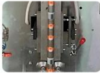
Back Sealing Mold