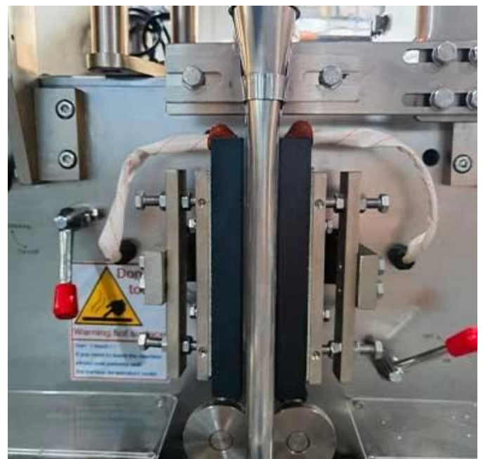
Bag sealing device