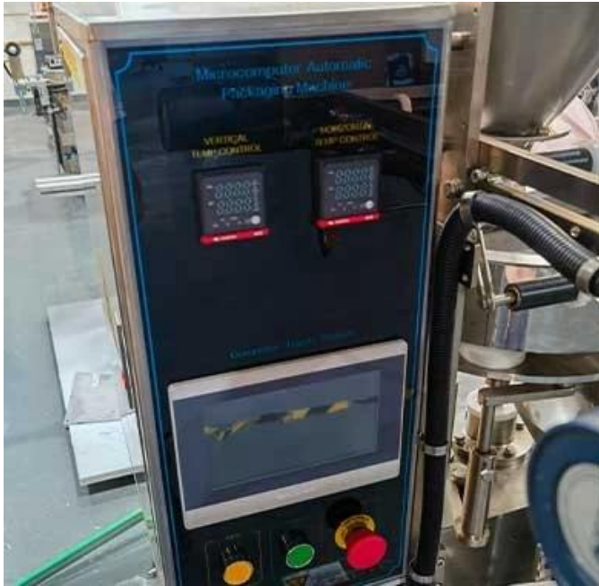
Smart touch screen