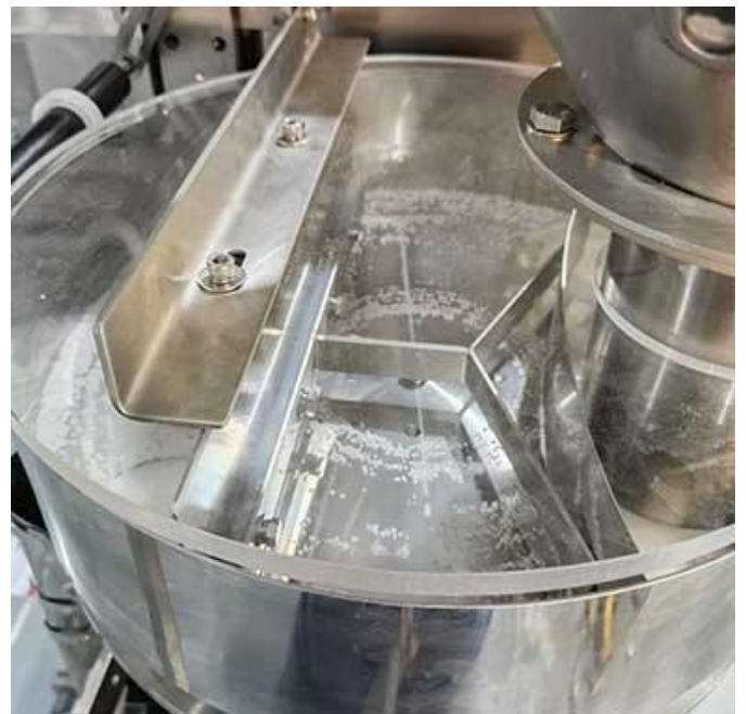
High-precision measuring cup device