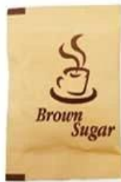
3 SIDE SEAL