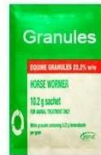
4 SIDE SEAL