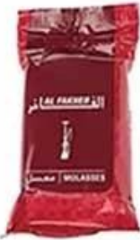
Plastic Bag Packing