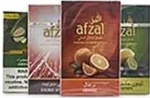
Cellophane & Tear Line Wrap