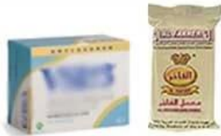
Bag Into Box