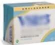
Bag Into Box