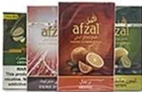
Cellophane & Tear Line Wrap