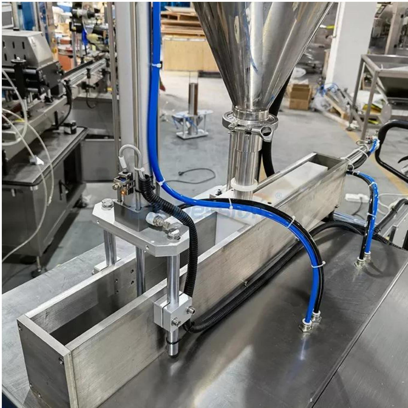
Pneumatic Pump filling